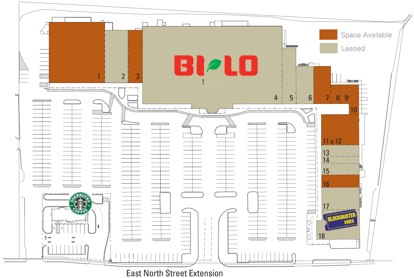
East North Street Extension