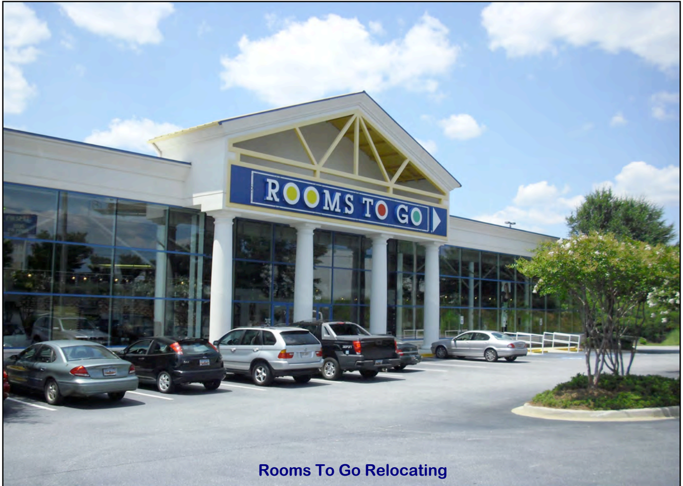
Rooms To Go Relocating